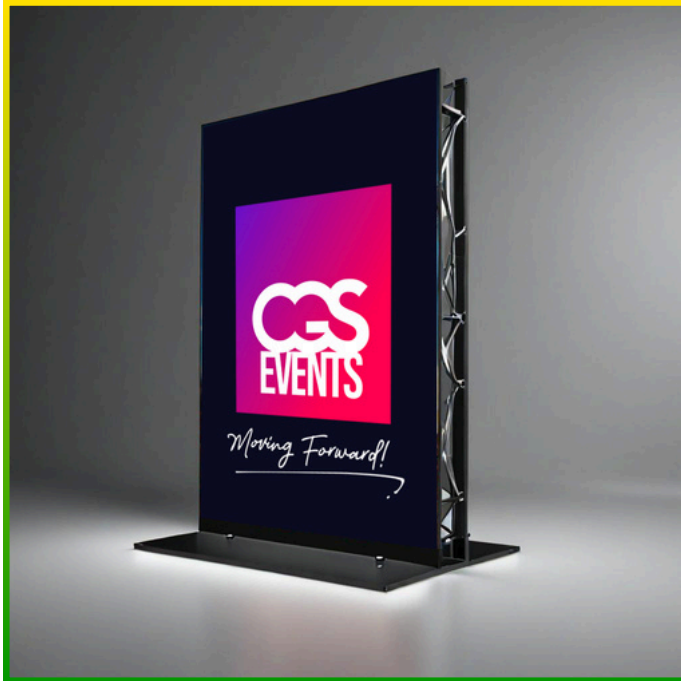
Example of a stand 3x2m / 6m 2 / 65ft 2 (includes 2x2m LED screen)